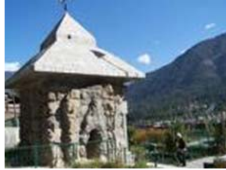
900 year old Hindu shrine of Lord Shiva in the Kashmir valley that has Muslim priests

“This book is a timely contribution to the ongoing debate on religion and religious identity in contemporary South Asia.”