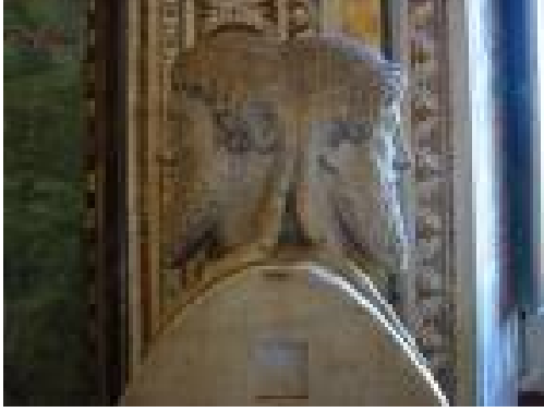
Roman Deity Janus Bifrons, the god of doorways