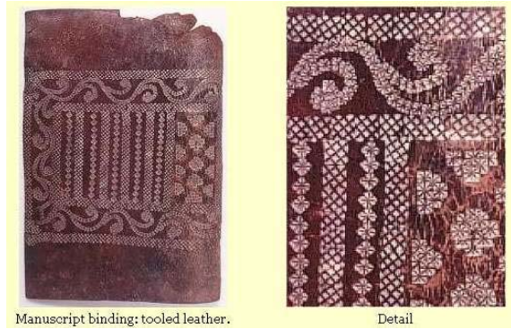
Manuscript binding: tooled leather.

With regard to this ‘borrowing’ of tradition, Khan emphasizes that it “is a conscious process through which elements from a different tradition are integrated into one’s own worldview to stress the profound unity of the Divine despite the plurality of vision” (Khan, 40). She claims that the result of this process is not necessarily innovation or the creation of a new religious