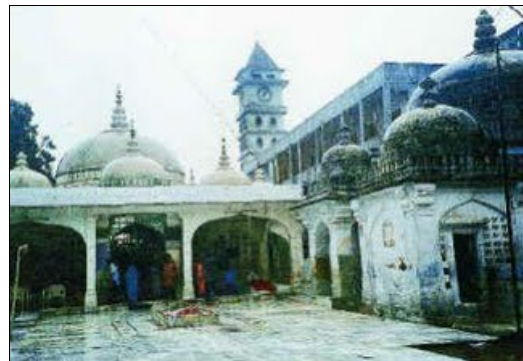
Shrine of Imamshahi community in Pirana